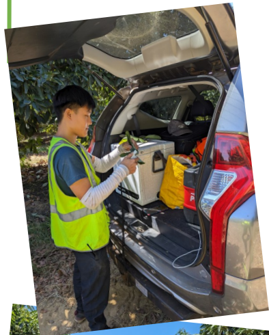
Photos from the field trips

A web platform was created for farmers in to visualise plant health and climate trends.